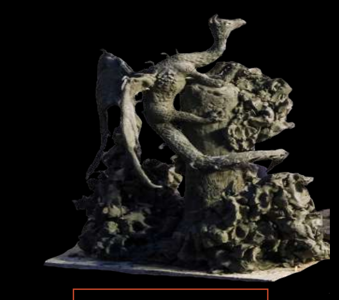
SCULTURA PETRA VERDUCHI